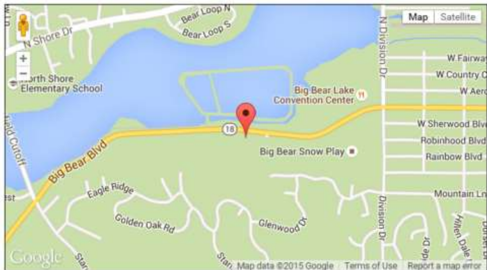
Big Bear Senior Center, 42651 Big Bear Blvd., Big Bear Lake, CA

Bearly Bytes Big Bear Computer Club Newsletter PO Box 645 Big Bear City, CA 92314 909.878.5822