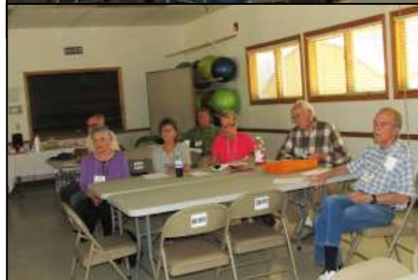
The Opportunity Drawing Winners