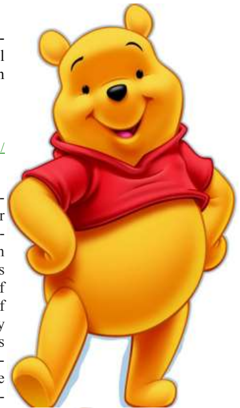
Winnie the Pooh's actual appearance.

1998, Nane Annan, wife of UN Secretary-General Kofi Annan, named Winnie the Pooh as the world's Ambassador of Friendship at the United Nations. The event was co-sponsored by the U.N. Department of Public Information and Disney Enterprises, and was co-hosted by Kathy Lee Gifford.